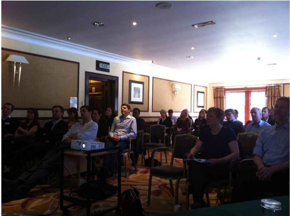
The audience, deep in thought at SPAN 2013.